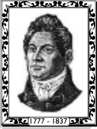
Famous Faces from History