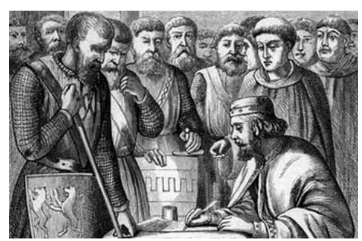
King John signing the Magna Carta.

This document is an important part of history because in ear of the rule of constitutional law in the English-speaking world, including Australia. Constitutional law means that laws are made in Parliament but are generally punished by the courts. It is a document which supports fundamental democratic beliefs implemented in Australia today - that we are all innocent until proven guilty and that our punishments must fit our crimes.