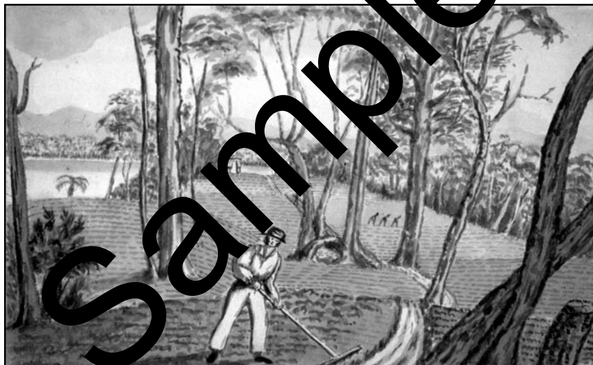
Alport Library and Museum of Fine Arts, Tasmanian Archive and Heritage Office