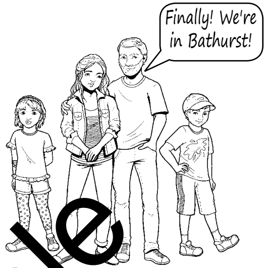
The Austin family - 2018